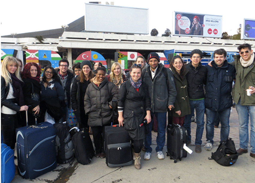
New Born. Some members of the E.MA gang gathered in front of the iconic 'New Born' on the last morning. This monument was erected in 2008 to celebrate the declared independence of Kosovo.