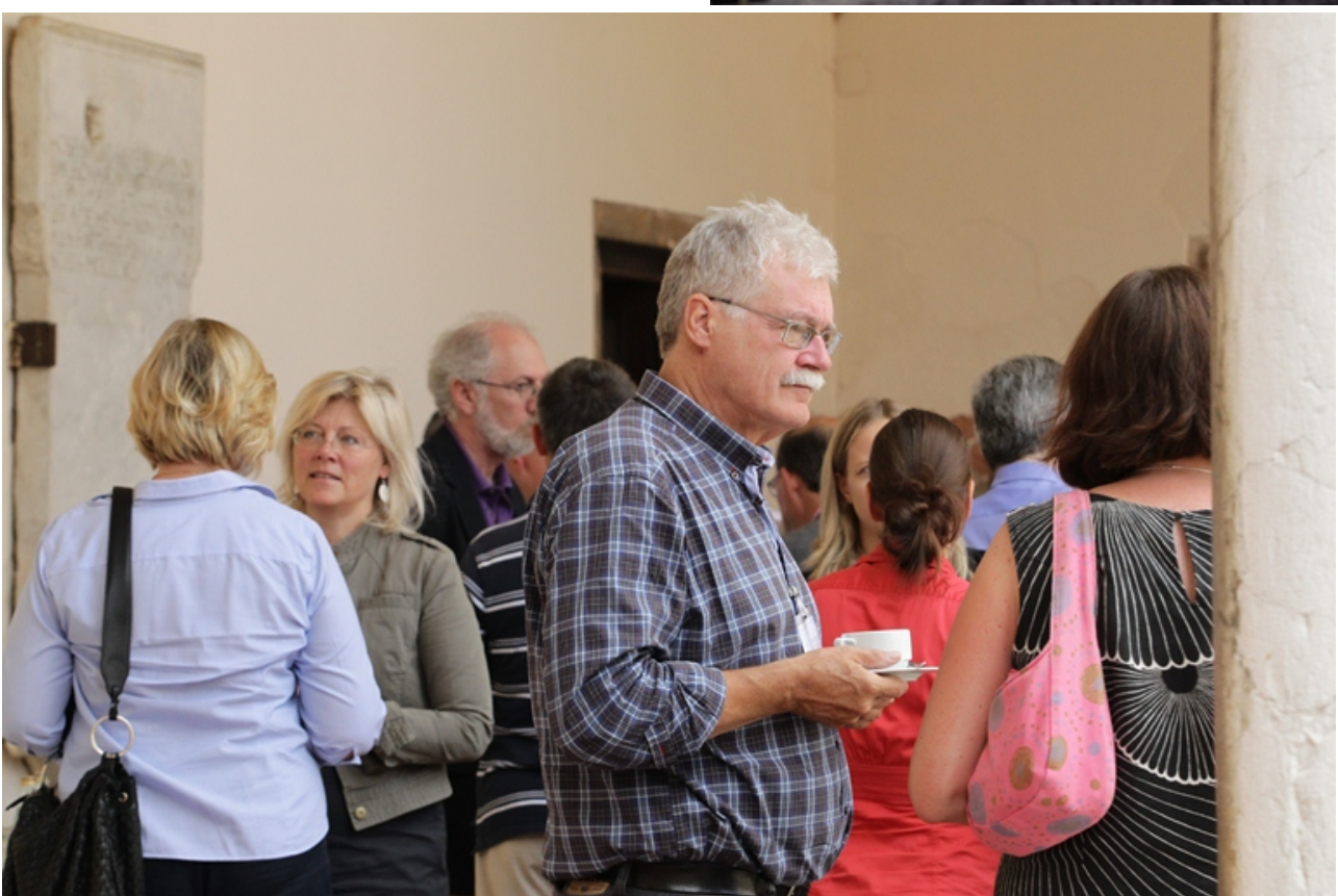
The EIUC Diplomatic Conference is every year devoted to an exploration of topical issues in the area of human rights and democratisation. Discover more about <u>conferences organised by EIUC</u>