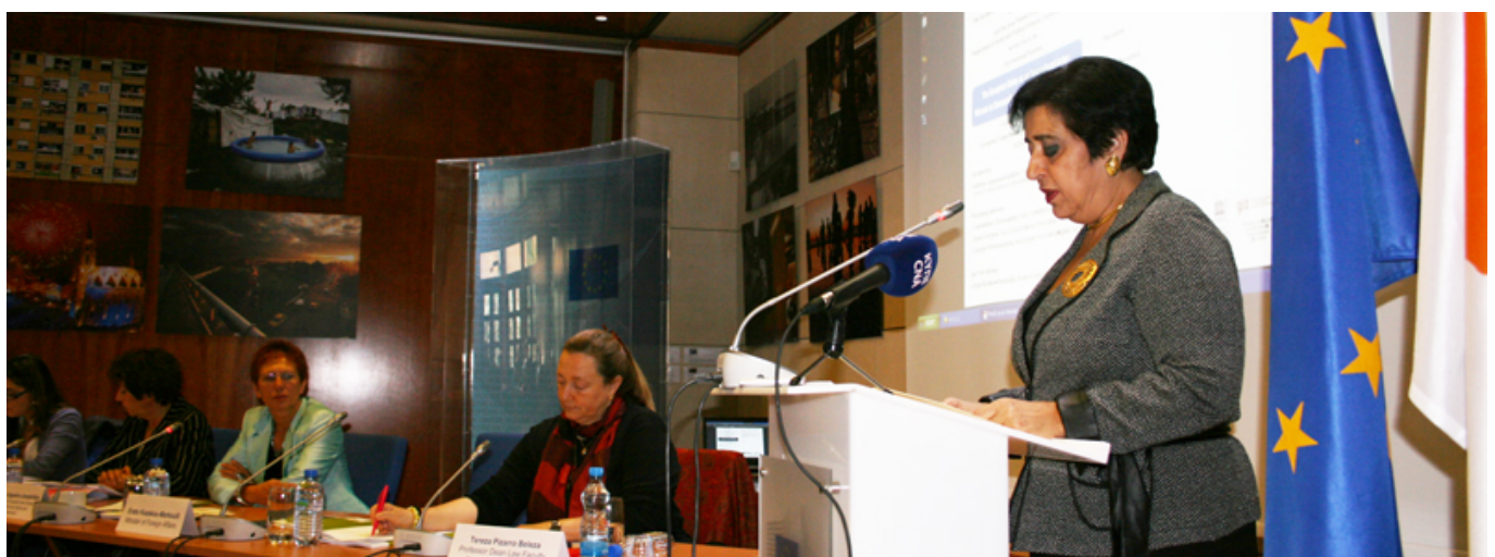
From right to left: Minister of Foreign Affairs Dr Erato Kozakou-Markoullis, Prof. Tereza Beleza Pizarro,

Minister of Foreign Affairs of the Republic of Cyprus Dr Erato Kozakou – Markoullis ' The European Union as an International Actor: Women in Democratic Transitions, Peace and Security ' Nicosia, 14 December 2012